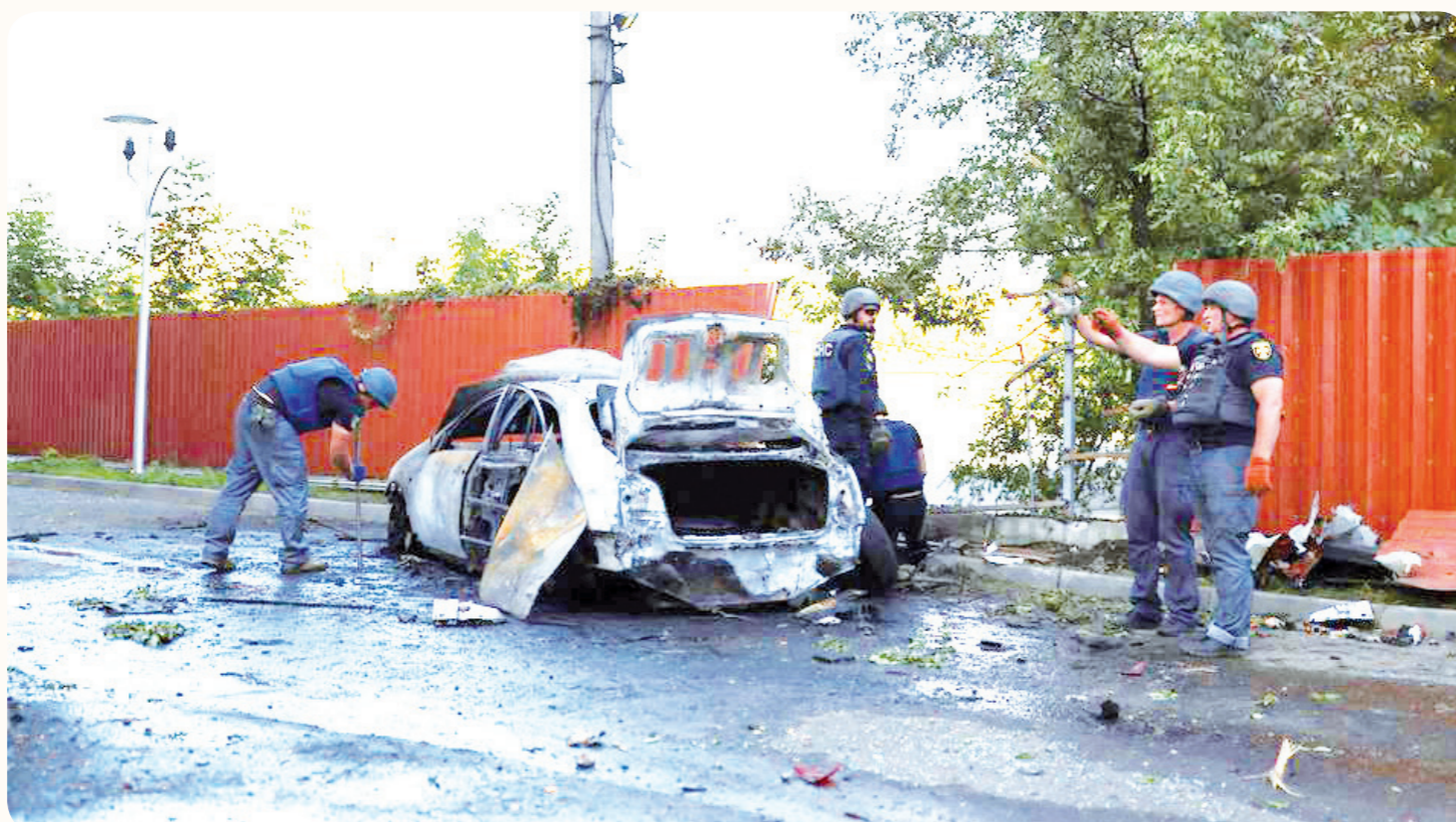
POLICE officers work next to a destroyed car after a Russian military strike, as Russia's operation of Ukraine continues, in Kharkiv, Ukraine.

British military intelligence, which is helping Ukraine, said that Russia's push towards the city of Bakhmut had been its most success-