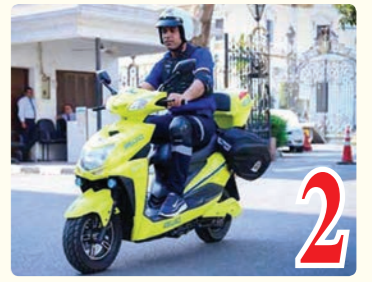
2 First aid by scooter