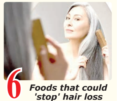
6 Foods that could 'stop' hair loss