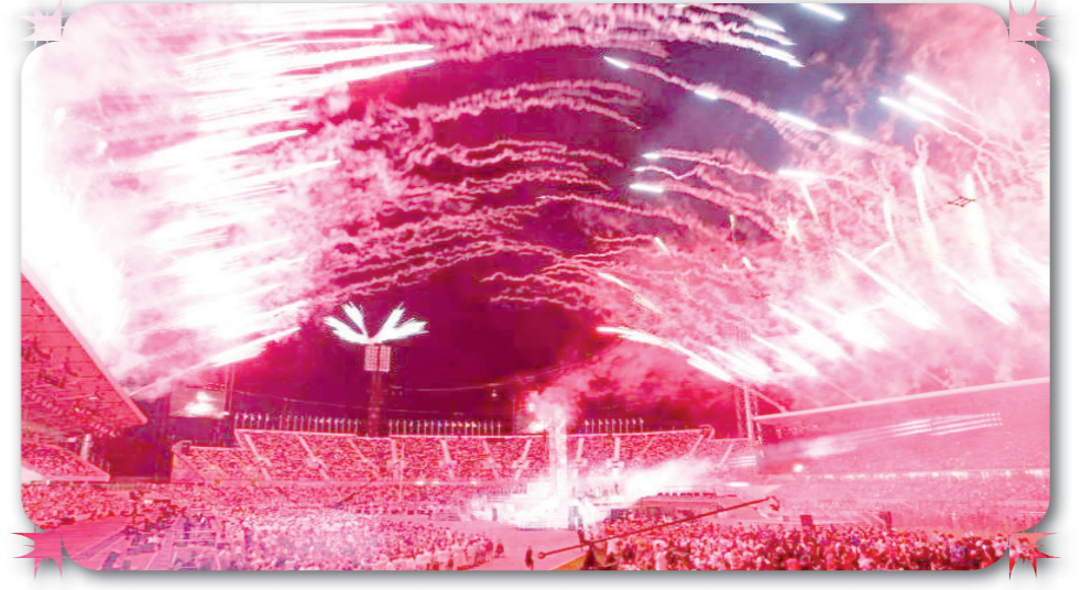
GENERAL view as fireworks are seen while Ozzy Osbourne performs during the closing ceremony in Birmingham.