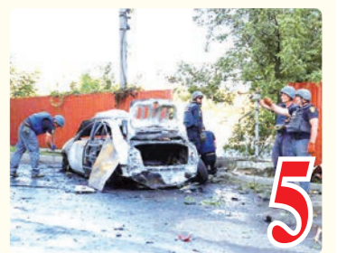
5 Moscow steps up attack eastern Ukraine