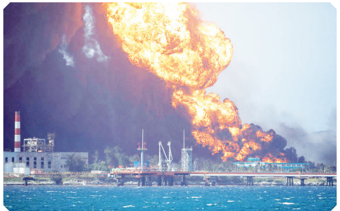
FIRE is seen over fuel storage tanks that exploded near Cuba's supertanker port in Matanzas, Cuba.

If Matanzas' containment walls can stop the fire