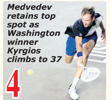
Medvedev retains top spot as Washington winner Kyrgios climbs to 37