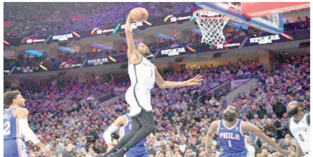
BROOKLYN Nets forward Kevin Durant (7) dunking against the Philadelphia 76ers during the first quarter at Wells Fargo Centre in Philadelphia March 10, 2022.

The 33-year-old forward, a two-time NBA champion and 2014 NBA Most Valuable Player, is entering the first season of a four-year contract extension worth US$198 million that he signed a year ago with the Nets.